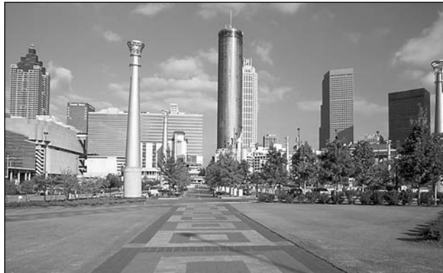
Atlanta hosts the 58th Annual Cancer Symposium