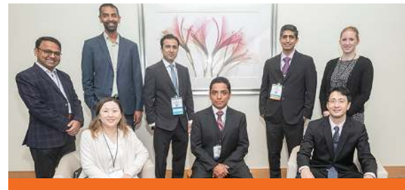
2019 International Career Development Exchange Participants